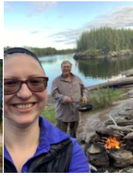
Day 5: Leaving our five-star camp site, we headed SW into a more open part of Smoothrock and just enough wind/waves to have me on edge. Fortunately, there are enough points, islands and sheltered sections to reach the long south arm of Smoothrock Lake. At the bottom is the channel to the Lookout River—very pretty, and where the river flows in were colorful yellow bushes. The beginning of the 1147m portage is a campsite with fire ring next to big boulder. A bit a junk in the fireplace. A good lunch spot too. I think maybe there's one really good tent spot. There were two green poles with a rope or net in between (gear for the spring sucker run?).

This portage goes through a relatively open and level wooded area. Not maintained recently, there are about 20 stepovers. Lots of past portage clearing work and cut logs were evident. This portage was one of my main challenges for this trip—being long. While I carried the canoe a ways, then dropped it and back for a pack, using the hopscotch method, my intrepid daughter who's been on an intensive PNW hiking program, zooms to the end and back to help the old man out. With numerous rests, I finally make it to the very pleasant campsite on a rise. It has a nice fire ring, sitting logs and lots of flat tent spaces. There's a short 5m drop to a back channel for water and another 30m down the portage to the Spring Lake landing.