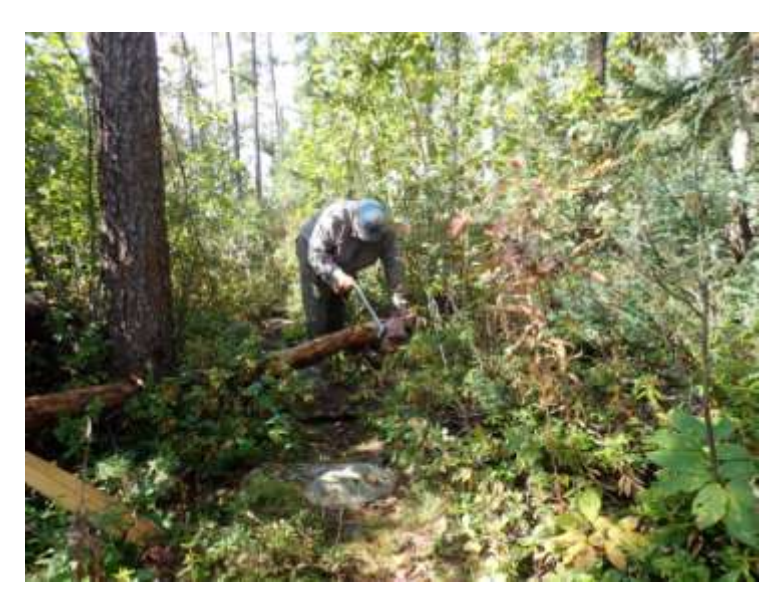
A bright and sunny day on Onamaka wash Lake, not too windy.

Of course, it was my turn too, and efforts were made with my Agawa Boreal Saw. I made a note to try out other boreal saws, perhaps with a bit more bite.