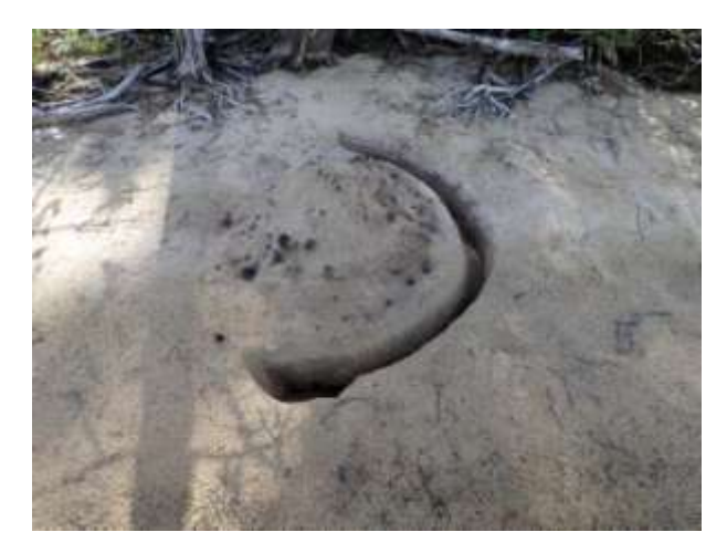
We stopped for lunch on the island's nice beach in a small bay, with a campsite nearby.

Here we saw caribou prints in the sand and a curious half circle.